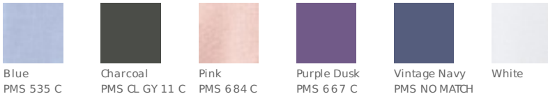
Blue PMS 535 C